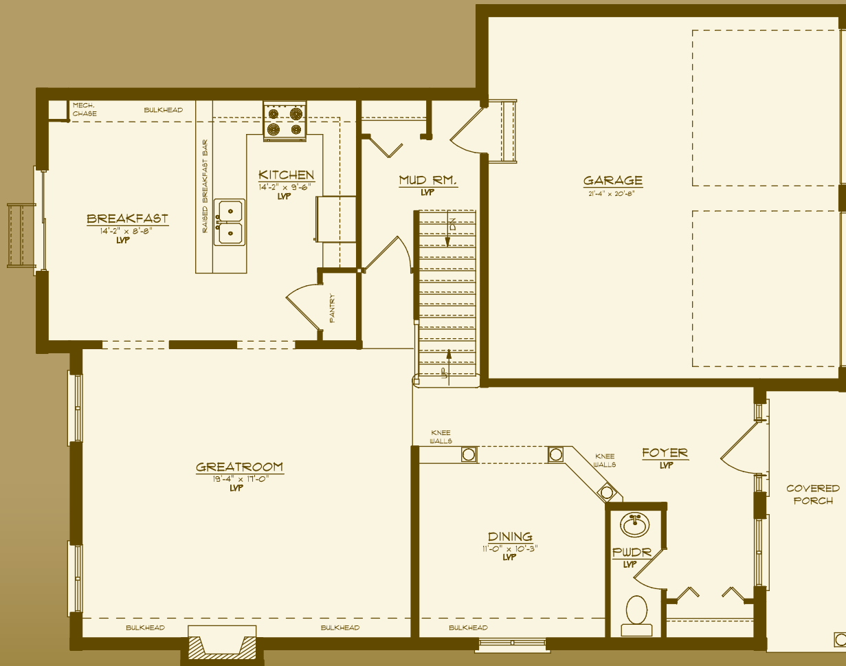
Main Floor 1,109 Sq. Ft.